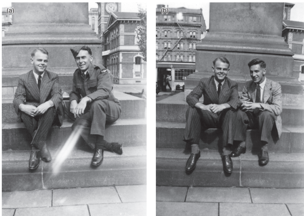
Figure 3 Friends sitting at the base of the Godley Statue in Cathedral Square, Christchurch, c.1949. The statue commemorates John Godley, founder of Canterbury. On the left in the second image is the United Services Hotel, popular in queer circles at the time.