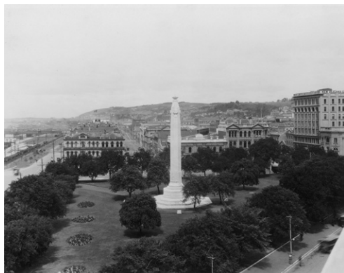
Figure 2 Queens Gardens, with the Cenotaph as its centrepiece. Alexander Turnbull Library, PAColl-7985-44.

statements were broadly consistent with each other, but there were substantial differences between each set of statements. I will begin with the two local lads' recollections. Isaac Walters told the court: